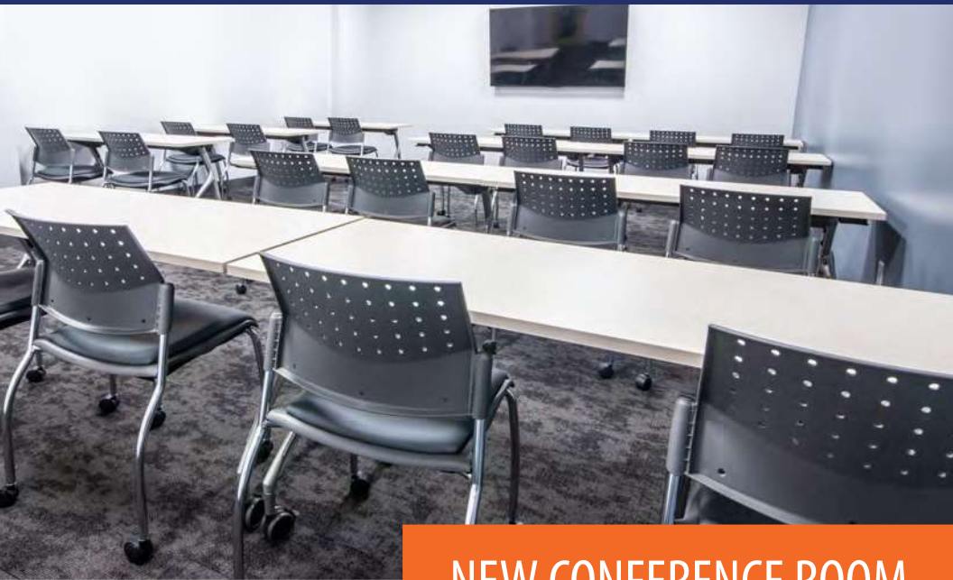
NEW CONFERENCE ROOM